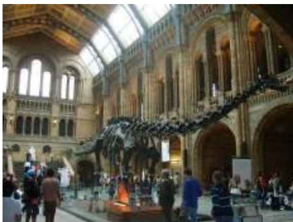
NATIONAL HISTORY MUSEUM

You have 3 minutes to prepare what you are going to say.