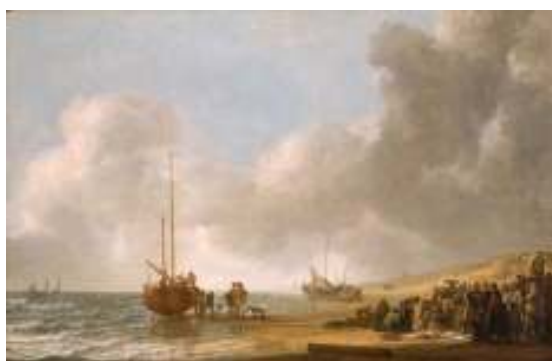
THE NATIONAL MARITIME MUSEUM