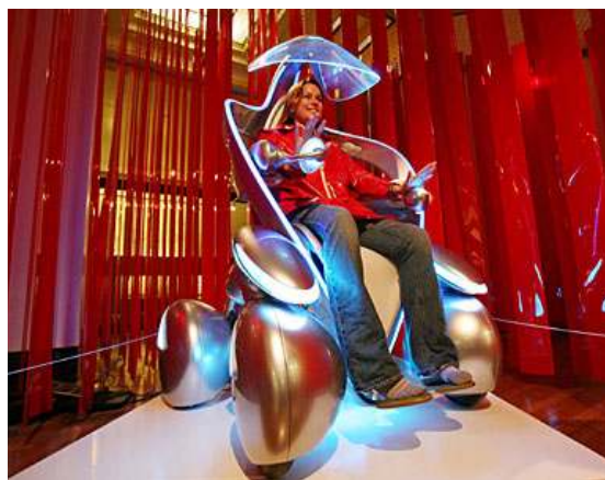
THE SCIENCE MUSEUM