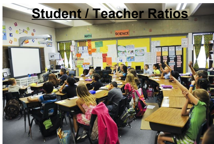
Student / Teacher Ratios